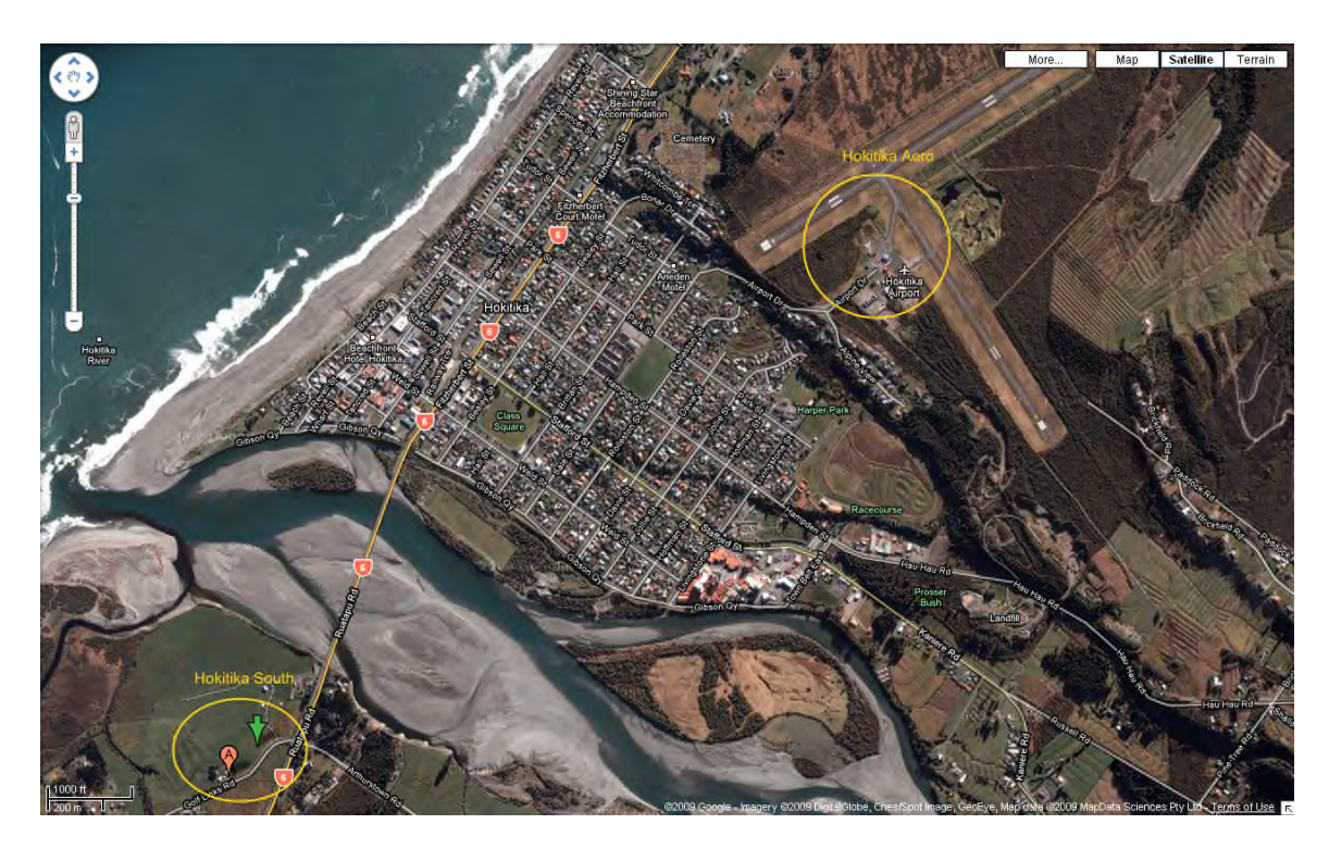
Figure 0-1: Hokitika showing the station locations based on NIWA Lat/Long values

Thorndon explanation, the higher station should be cooler, based on the expected environmental lapse rate.